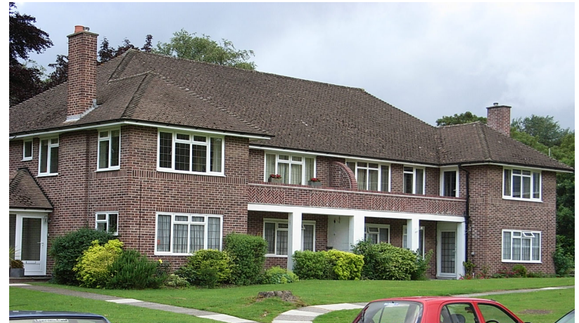
Frontage of block