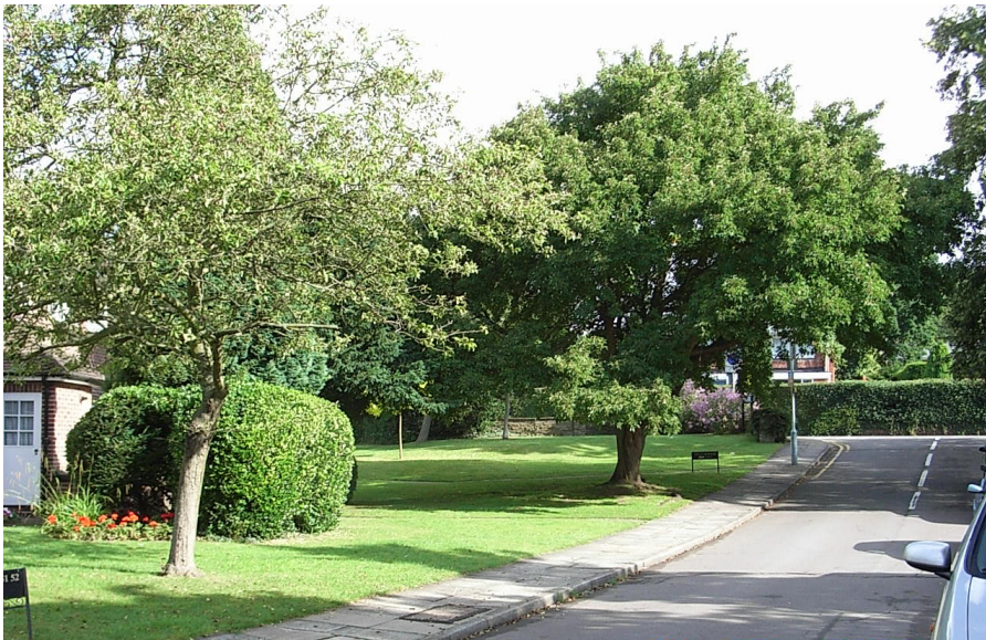
View of grassed areas and mature tree planting

The whole of the Conservation Area is owned by the residents themselves, who have established The Glen Residents' Association Ltd. to manage the Estate on their behalf. The Council will, therefore, liaise with the Association at all times in respect of management issues.