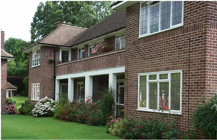
Elevation of block with loggia detail