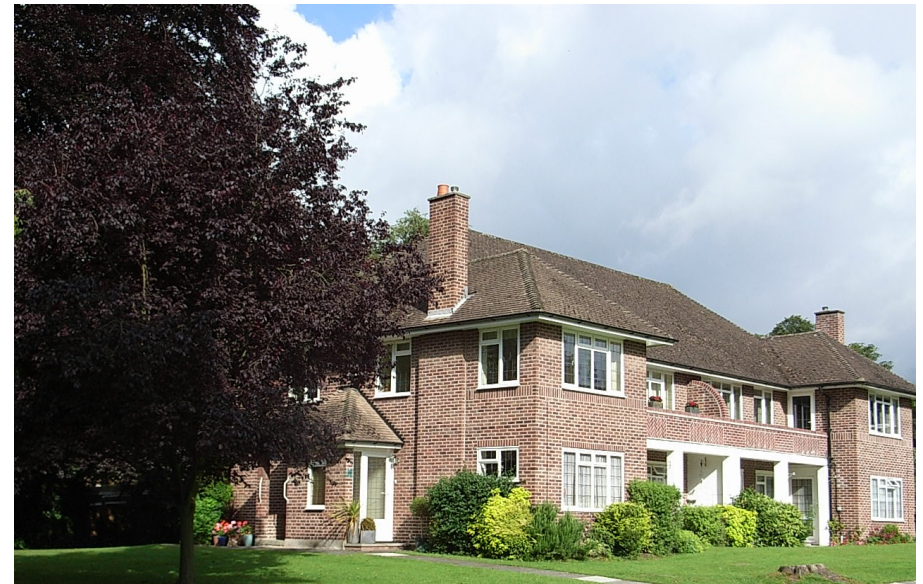
Unaltered buildings in landscaped setting