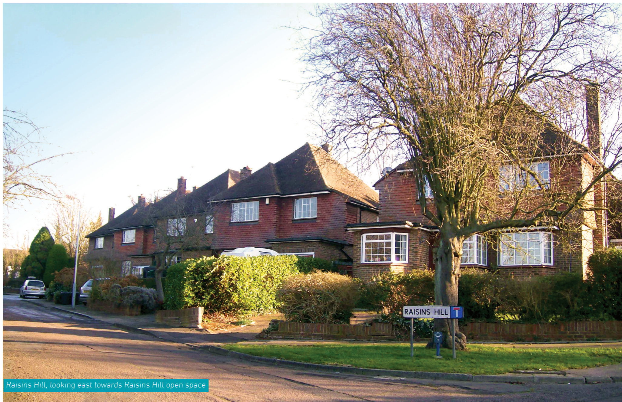
Raisins Hill, looking east towards Raisins Hill open space

The informal open spaces to the east and south, street trees and the long front gardens, many with mature hedges, give the area a spacious Garden Suburb appearance and green character. Front boundary treatments are characterised by hedges or dwarf brick walls, with decorative brick on edge coping. These, together with the road layout and gently sloping topography, create an attractive street scene. The spacing between the houses, landscaping and views into the back gardens all form part of the setting and special character of the area.