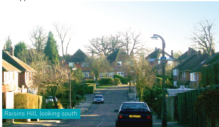
Raisins Hill, looking south