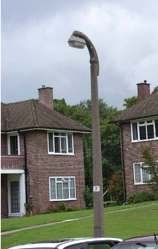
An early lamp post design

9.4 Some of the pavements have been broken by vehicles mounting them, particularly at the junctions of the side roads with the main road through the estate.