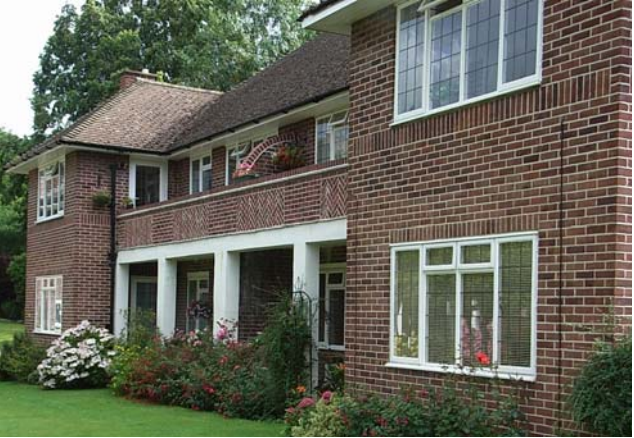
Principal elevation with loggias and balconies