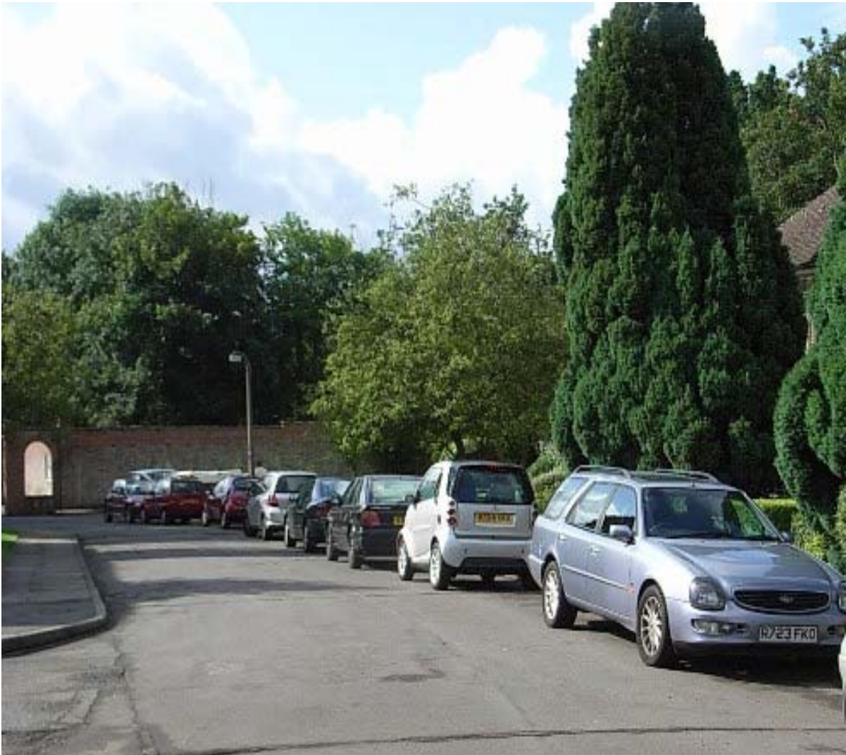
View through to the garage court

10.4 A management plan is to be written and approved by Cabinet to ensure the future protection and enhancement of this area. Consideration will be given to the problems and pressures referred to above.