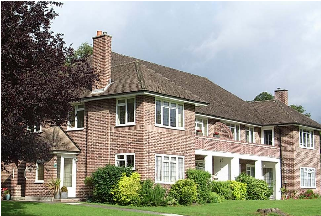
Roofs, windows, doors and the colour and types of materials used are very important to the overall character of The Glen

7.7 The roofs are covered in brown tiles with bonnet hips. The leases forbid television aerials, or any poles or masts 'deemed of unsightly appearance or the erection of any satellite dishes'. There are thus no external telecommunications equipment nor telephone wires. This homogeneity of roofscape is an important feature in the character of the estate and adds considerably to the attractiveness of its appearance