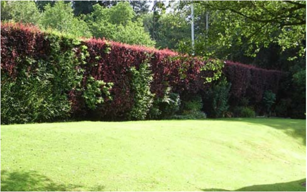
Front boundary hedge

5.2 The Conservation Area includes only that site developed as The Glen, with 13 blocks of maisonettes, associated landscaping and garage court. To the north is the boundary with Green Lane; to the west is the housing estate at Myrtle Close; to the east is Wilford Close, the Surgery and the municipal car park; and to the south-east is the boundary with the grounds of Northwood College.