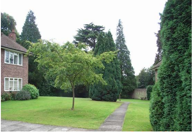
The Glen has a mature garden setting, with many protected trees