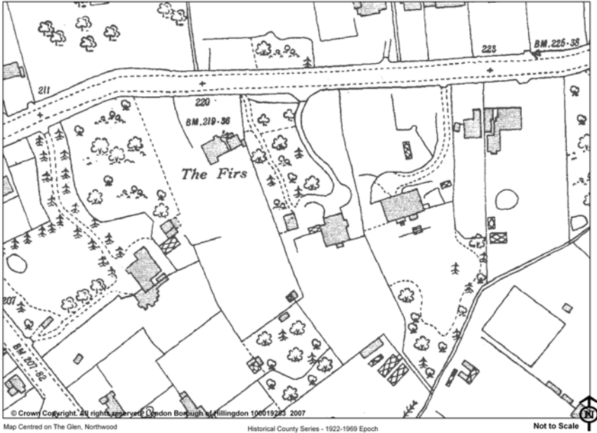
Plan of The Glen site 1922

4.4 The Residents Association has an elected Chairman and Board of six, who meet regularly to decide applications from residents who wish to make internal or external alterations, and to organise communal interests such as gardening, garage repairs, highway issues, and insurance.