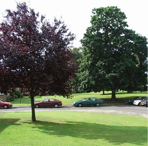
View to the south-west of The Glen

1.0 The Glen, Northwood, Conservation Area was designated in July 2007, following a Borough wide review of existing heritage areas. The Glen is a 1950's planned development comprising blocks of maisonettes grouped in a landscaped area, either side of a central spine road. It is located on the south side of Green Lane just to the west of Northwood's shopping centre.