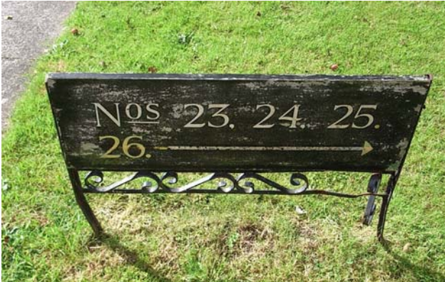
Small lectern signs provide guidance for visitors

9.3 The roadways are in generally poor condition, with the tarmacadam surface missing in places.