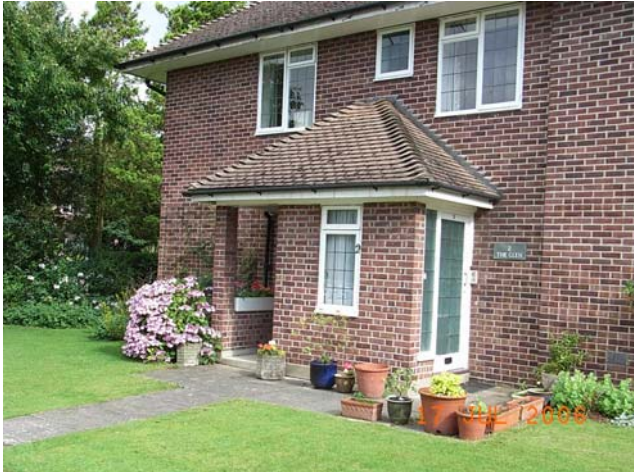
Typical porch arrangement

7.5 The colour and consistency of materials is important to the character of the estate. The buildings are of identical brown brick, with herringbone decoration on the fronts of the balconies, and white render within the balconies and loggias.