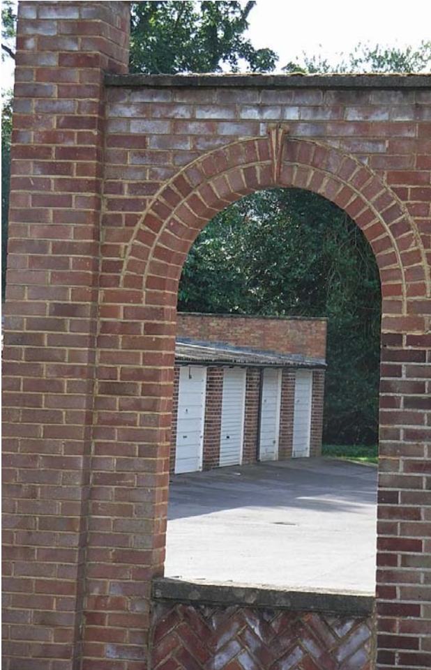
View through the gateway to the garage court

5.1 The maisonettes are arranged in 13 two-storey blocks, four to a block. The larger group comprises eight blocks, the smaller group, five, and each group forms a circle either side of the central access road. This access road runs from Green Lane down to an 'L' shaped garage court, fronted by a brick wall with feature entrance, in the style of a grand stable block.