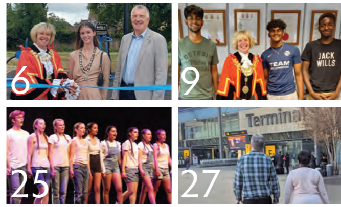
COVER PHOTO: A LEARN HILLINGDON STUDENT AND TUTOR

Advertising deadline for next edition: Monday 26 September