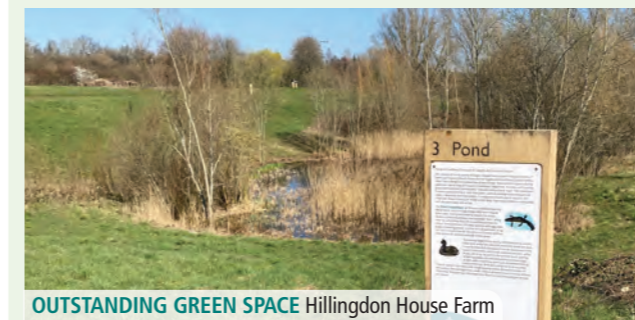
OUTSTANDING GREEN SPACE Hillingdon House Farm

The council has once again been recognised for its outstanding parks and open spaces, after four more have received prestigious Green Flag Awards. The awards – which celebrate the most beautiful and well-managed outdoor spaces nationally and internationally – were given to Rosedale Park in Hayes, Moorhall Recreation Ground in Harefield, Rockingham Recreation Ground in Uxbridge and Hillingdon House Farm in Uxbridge. The new additions bring the borough's total to 67 awards (66 of which are maintained by the council)