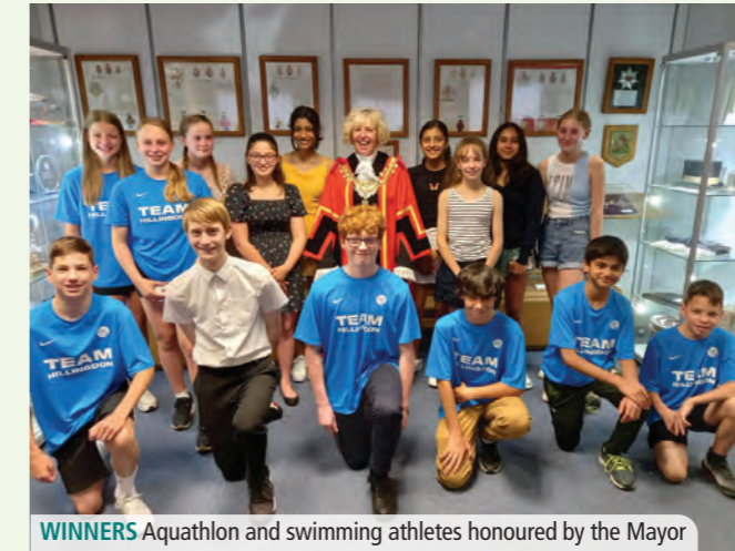
WINNERS Aquathlon and swimming athletes honoured by the Mayor

The 2022 games started with a Cross Country event at Parliament Hill where male and female athletes competed at different