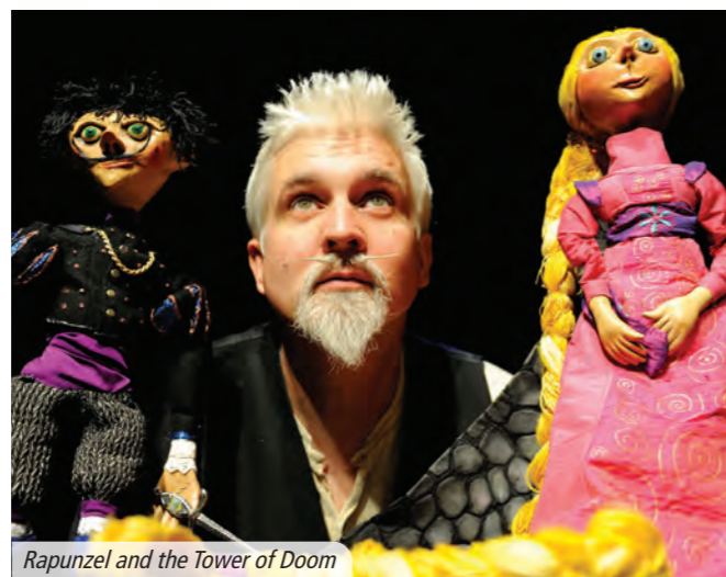
Rapunzel and the Tower of Doom

From musical theatre greats, Stephen Schwartz ( Wicked ,