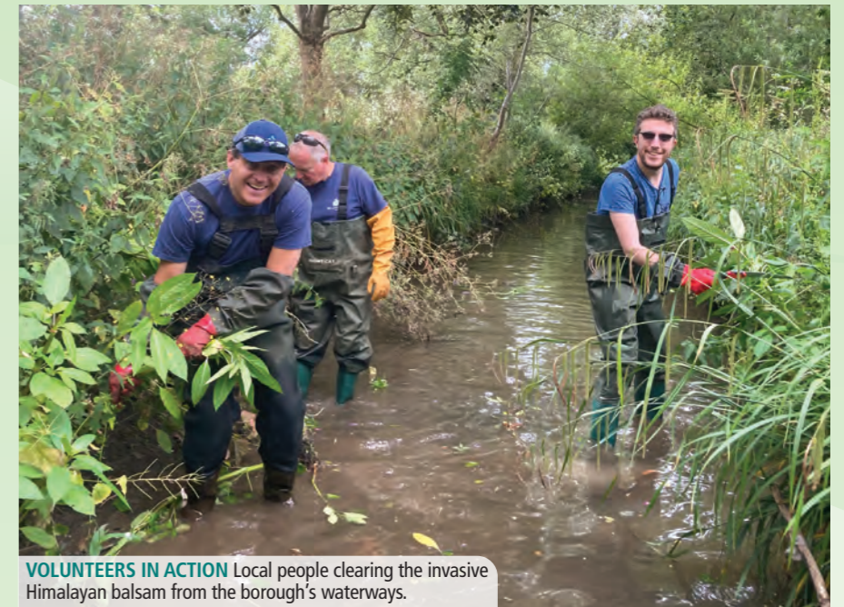
VOLUNTEERS IN ACTION Local people clearing the invasive Himalayan balsam from the borough's waterways.

council is in the process of replacing illuminated traffic bollards that have reached the end of their useful life with new rebound bollards manufactured by TMP.