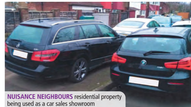
NUISANCE NEIGHBOURS residential property being used as a car sales showroom

A husband and wife have been fined £6,500 after ignoring a planning enforcement notice ordering them not to use their Uxbridge home as a car sales showroom and garage.