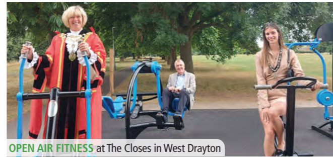
OPEN AIR FITNESS at The Closes in West Drayton

A new outdoor gym has been installed at The Closes thanks to the council's popular Chrysalis scheme.