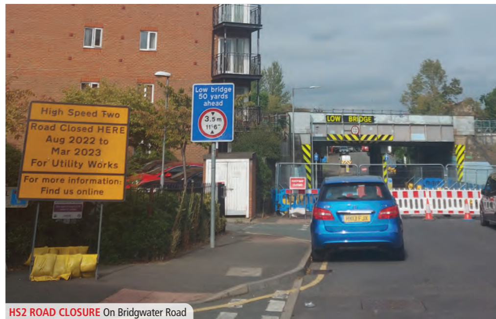
HS2 ROAD CLOSURE On Bridgewater Road

The team has met fortnightly with HS2 to ensure the council's position has been taken into consideration ahead of each strand of work commencing and to ensure residents' journeys are impacted as little as possible. The works for Ickenham Road (West Ruislip Tube Station) have been completed, and HS2 was working on reinstatement of the central reservation, which was expected to have been completed as Hillingdon People went to press. The council pushed for the works to include reinstatement of the whole works area, rather than a patch repair.