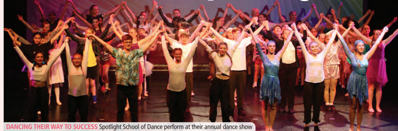
DANCING THEIR WAY TO SUCCESS Spotlight School of Dance perform at their annual dance show

The council's ward budget scheme is open for 2022/23, and residents are invited to put forward applications for funding for projects which can benefit their communities.