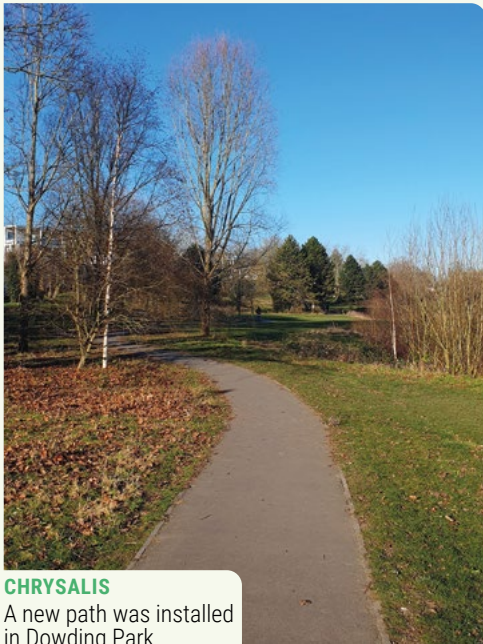
CHRYSALIS A new path was installed in Dowding Park