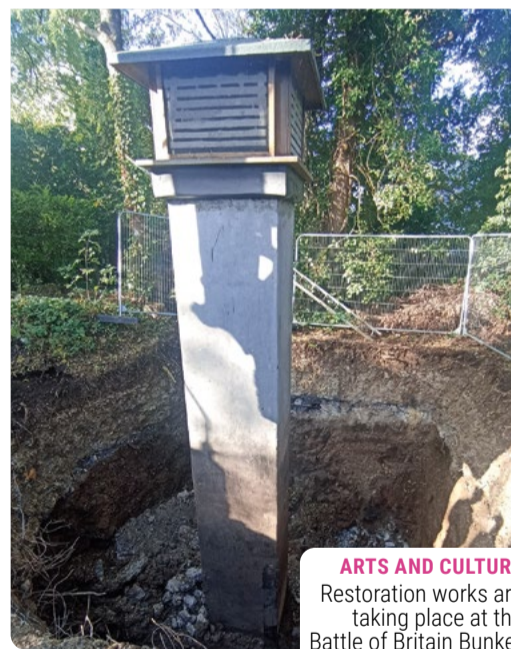
ARTS AND CULTURE Restoration works are taking place at the Battle of Britain Bunker