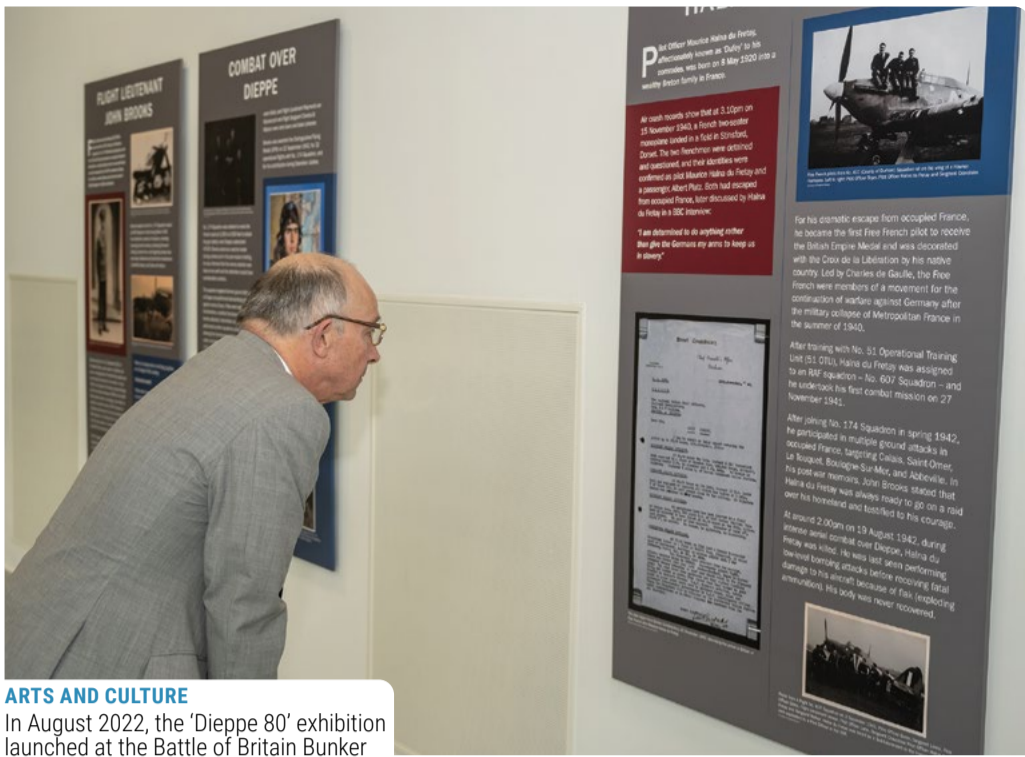
ARTS AND CULTURE In August 2022, the 'Dieppe 80' exhibition launched at the Battle of Britain Bunker