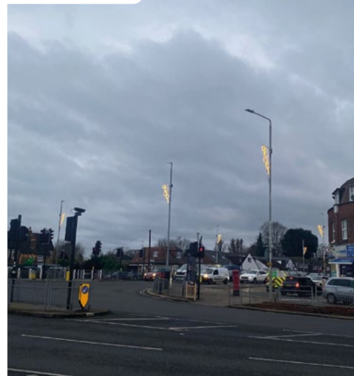
CHRISTMAS LIGHTS Christmas lights in Crescent Parade