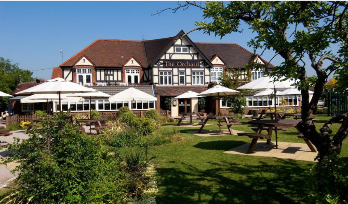
Fig 2. Historic Postcard image of The Orchard