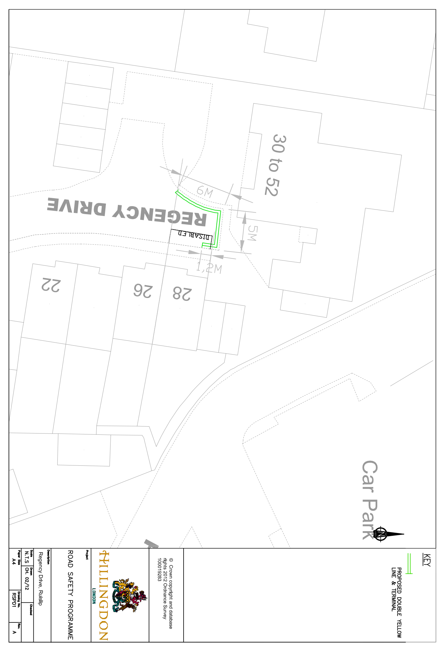
1TEM 6 & 9