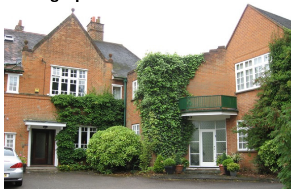
Front View: Little Mead and Eastcote Point (1954 extension)