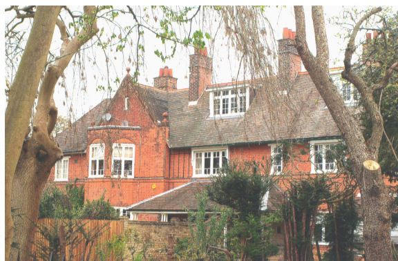
Rear view: Little Mead and The Penthouse