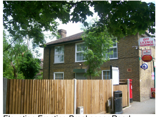
Elevation fronting Northwood Road