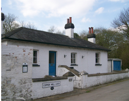
Canal side elevation