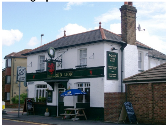
Elevation from High Street