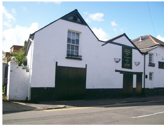
Stable, elevation from Cranford Lane