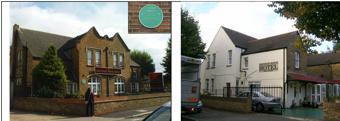
Elevation fronting Church Road