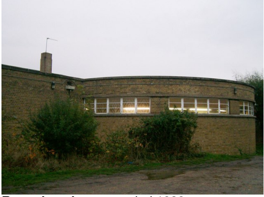
Street Elevation- part of Mission Chapel 1896. Rear elevation- extended 1938