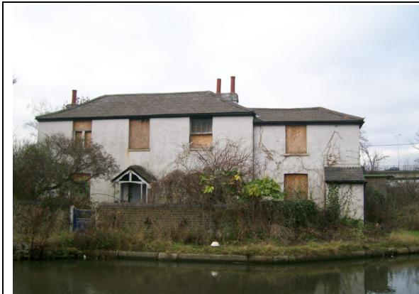
Front elevation from the Canal