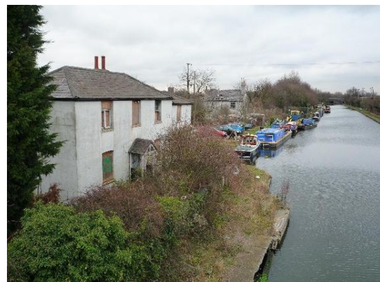
Front elevation from Bull's Bridge