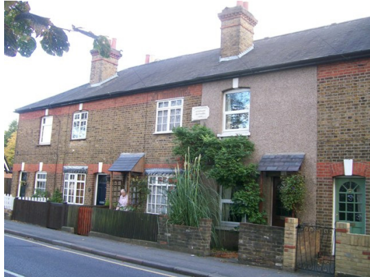
Rosebank Cottages (3-13 Harlington Road)