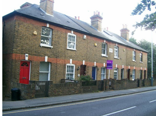
Sunningdale Cottages (15-25 Harlington Road)