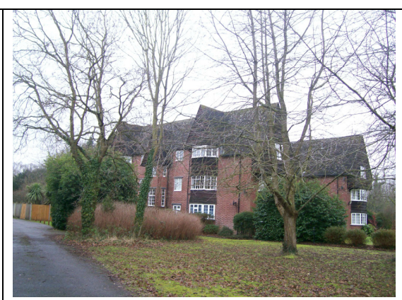
Front Elevation- Milton Road