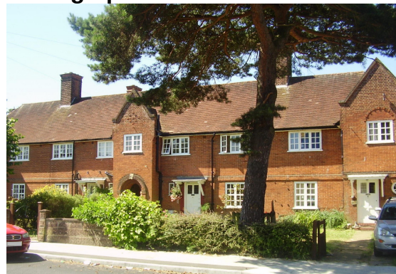
Photograph: No 34-40