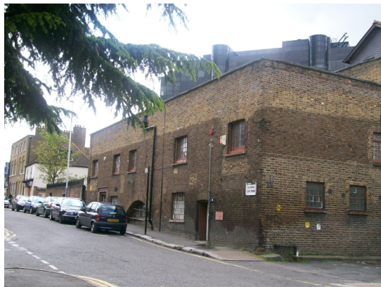
Elevation fronting High Street