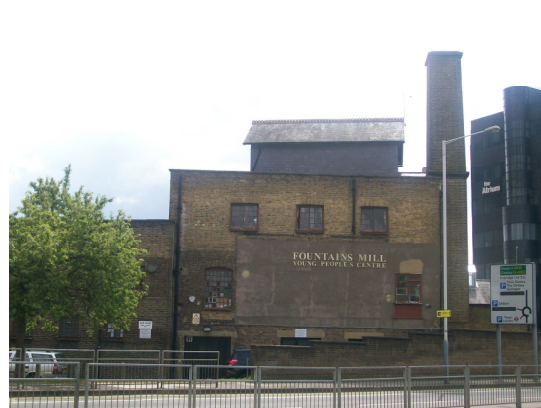
Elevation fronting Oxford Road