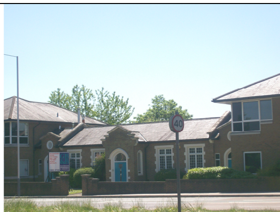
Front elevation, 2009