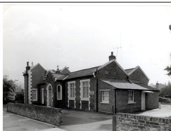
Front elevation, 1970s