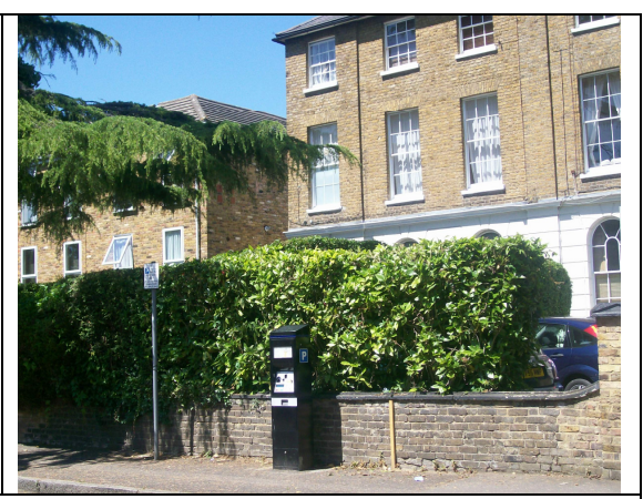
Statement of significance/ Reasons for designation

Architectural: Early to mid C19 pair, each three storeys plus basement, three windows wide. Low pitched hipped slate roof with shallow eaves soffit. Yellow stock brick. Axis panel and end bays project slightly. Bonded rusticated stucco ground floor with moulded cornice. Gauged, flat brick arches to first and second floor sash windows with glazing bars. Ground floor openings round headed, sash windows with glazing bars and six panel doors with plain fan lights. Forecourt Wall: Yellow brick wall of medium height, with stone coping, ramped up to a pair of square gate piers with stone pedimented tops. Townscape: Landmark building, contributes to street scene and local character.