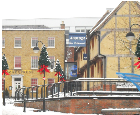
View from High Street