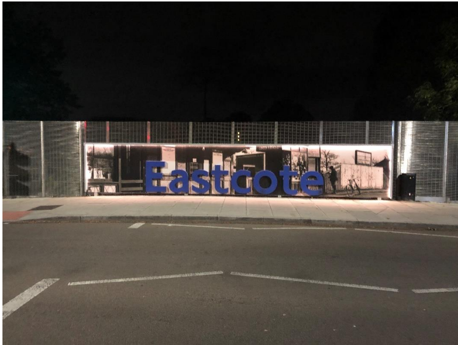
Figure 3: Eastcote Sign