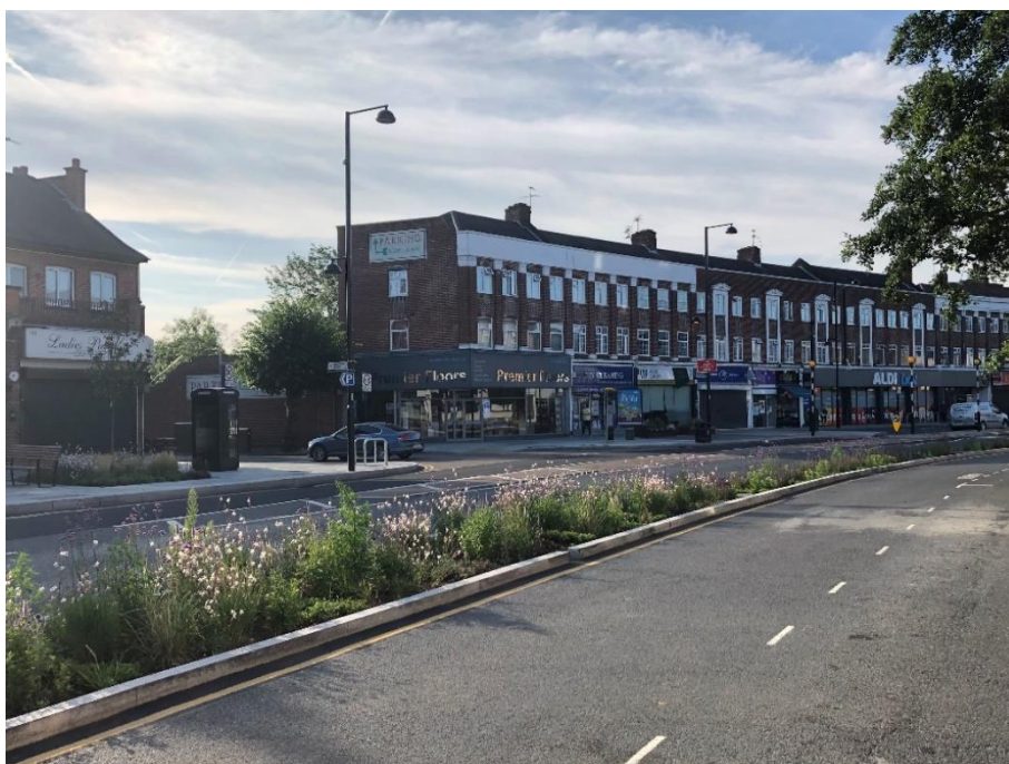
Figure 4: Rain Garden